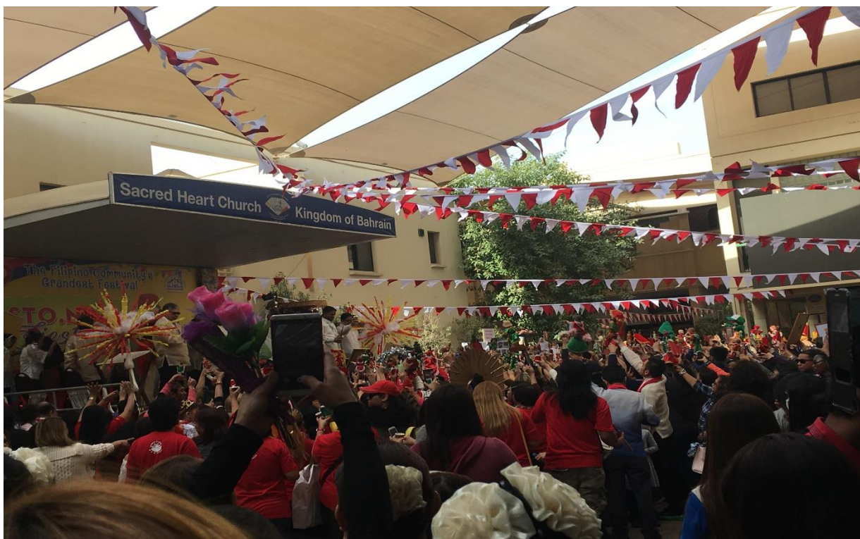
Crowd of the devotees of Sto. Niño