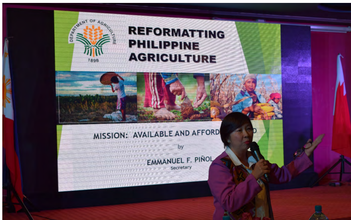
During the lecture of Usec. Evelyn Lavina, of the Department of Agriculture

21 December 2016 – The Department of Agriculture, in cooperation with the Philippine Embassy in the Kingdom of Bahrain, organized an Agribusiness Investment Forum at the Premier Hotel in Manama on 15 December 2016 from 5:00 P.M. to 10:00 P.M.